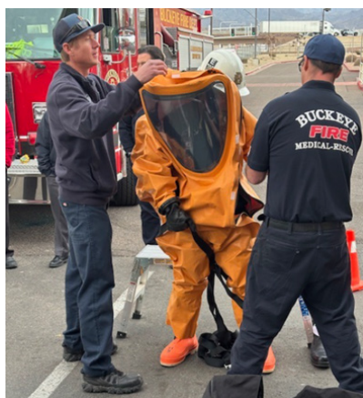
Department & Item: Fire – Level A Hazardous Materials Suits

Caption: The three images were taken at an Equipment Dedication Event at the Firehouse Subs in Buckeye in January 2025. The Grant Team applied for and was awarded over $32,000 for the purchase of Level A Hazardous Materials Suits, as showcased in photos above and to the left. These Hazardous Materials Suits are critical to the safety of our Buckeye Fire-Medical-Rescue Department personnel.