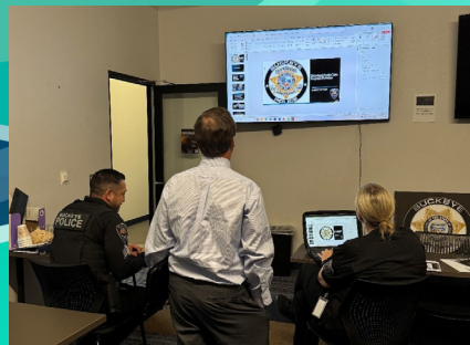
Pictured above is the Buckeye Police Department Crisis Intervention Team discussing various police grant-funding needs.