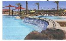
SAGE CENTER - SWIMMING/SPA

EXCEPTION RANCH IS OWNED BY THE ARIZONA STATE LAND DEPARTMENT