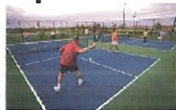
SAGE CENTER - SPORTS